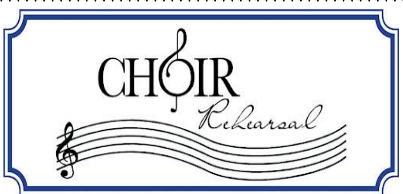
Chancel Choir Rehearsals Resume beginning Wednesday, September 8 at 7:00 p.m. in the Sanctuary